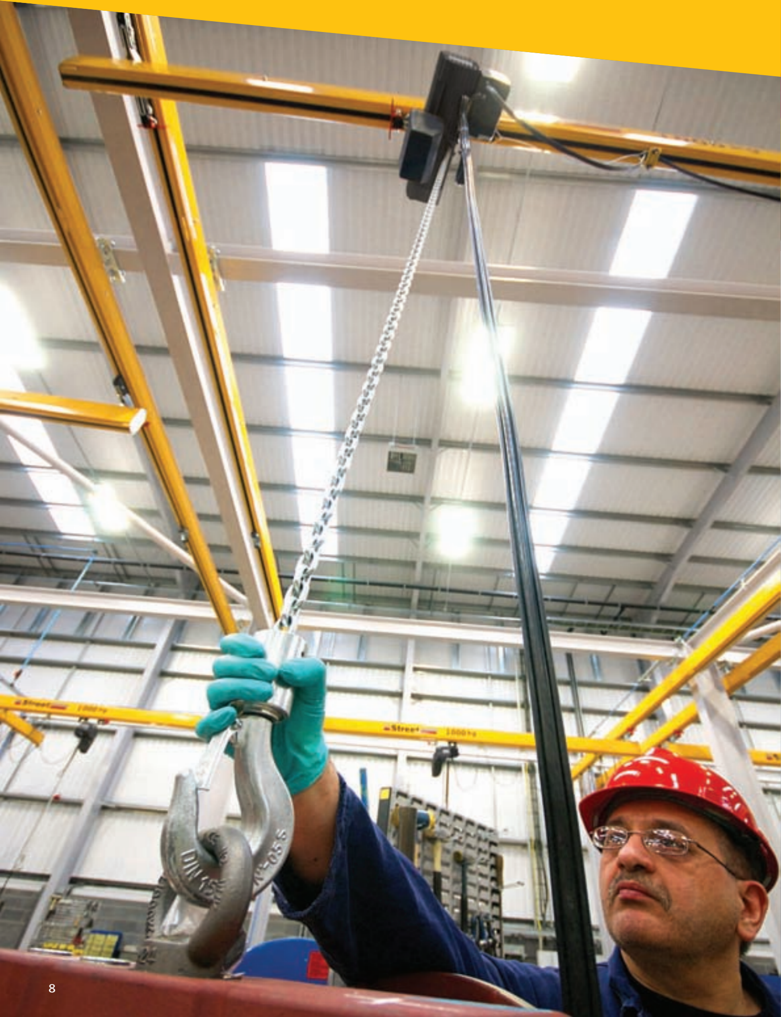
LX Chain Hoist Applications: Street 'LCS profile' crane