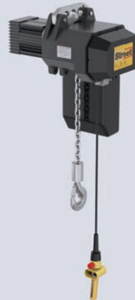
LX EYE SUSPENSION HOIST