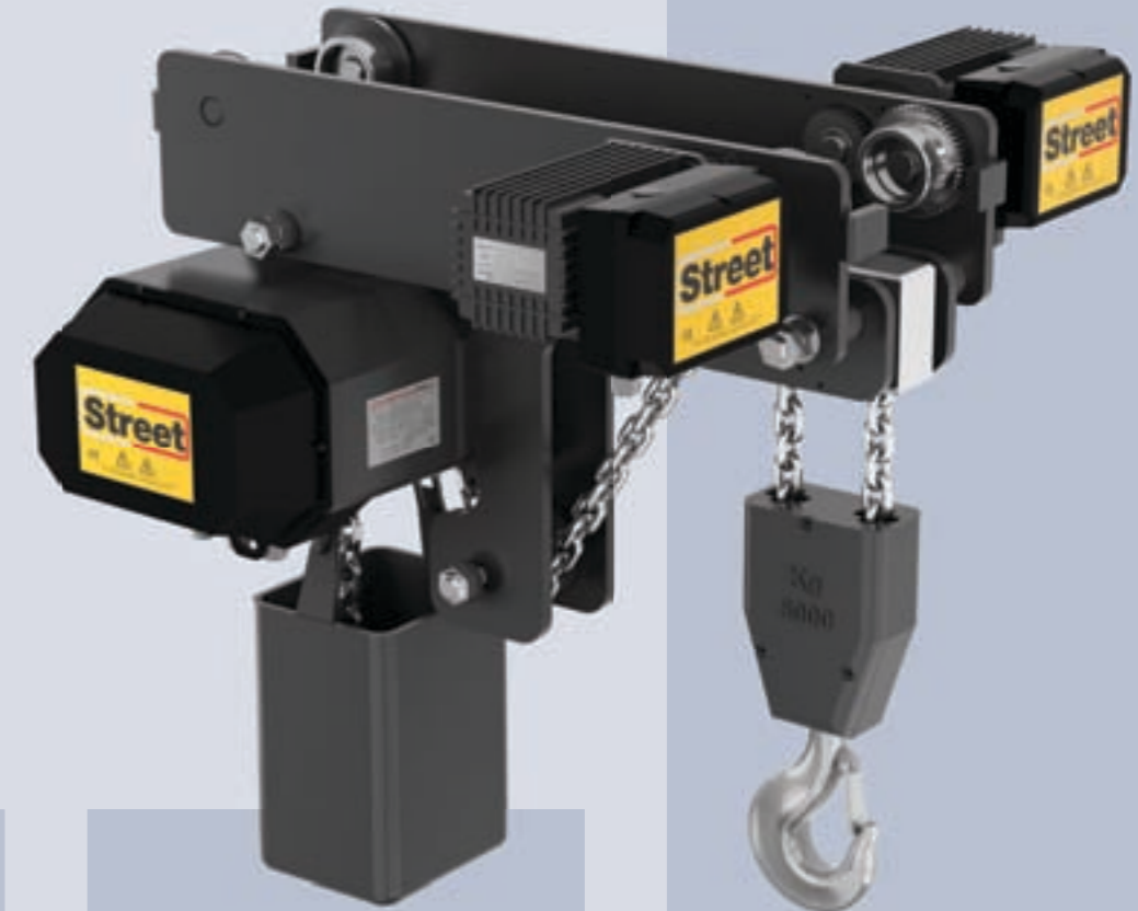
LX LOW HEADROOM HOIST WITH POWER TROLLEY