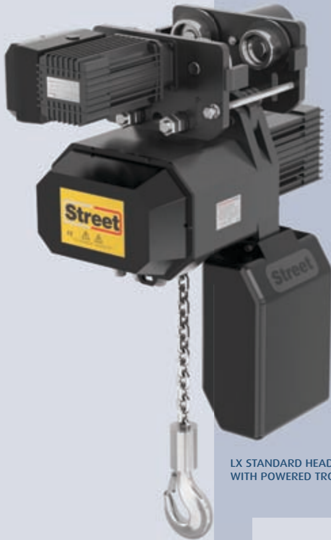
LX STANDARD HEADROOM HOIST WITH POWERED TROLLEY